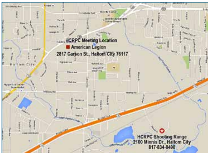
Range & Meeting Locations